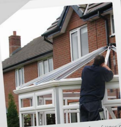
Living Roof uses the Classic roof so fitters can swap old for new very quickly

A. It is perfectly feasible to change simple designs over the course of one day – plaster boarding and skimming would then take place over the next day or so. Ultraframe retailers will protect any existing finishes during the project.