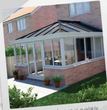
LivingRoof's Cornice feature is available in grey (to match the roof) or white

A. The roof comes as standard with black 'ogee' pvc shaped gutter – this is the lowest cost option. Alternatively, we offer a powder coated aluminium Cornice which adds a decorative feature between the existing windows and the new roof, hiding the gutter and the ends of the glazing bars.