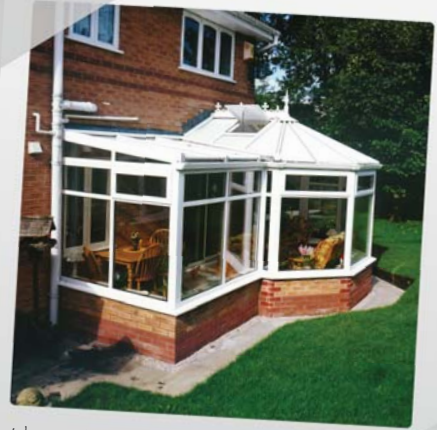
Upgrade your P-Shape conservatory

A. An existing conservatory with doors into the house is 'exempt' from Building Regulations but changing the roof to a solid one means that Building Regulations now apply. Don't worry, your Ultraframe retailer will take care of everything.