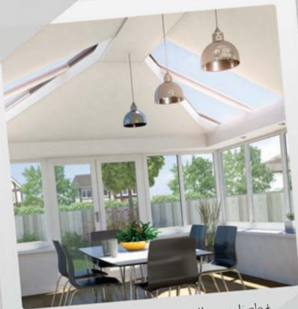
LivingRoof's versatility allows light into adjacent rooms

A. LivingRoof has the option to have inserted in virtually any position glazed panels to allow light into the existing home. These glazed panels can be inserted at virtually no additional cost.